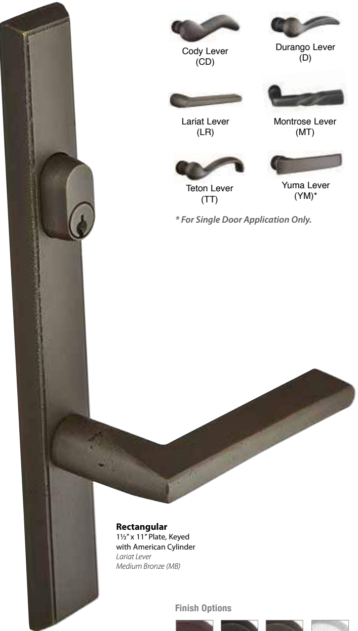
Rectangular 1½" x 11" Plate, Keyed with American Cylinder Lariat Lever Medium Bronze (MB)