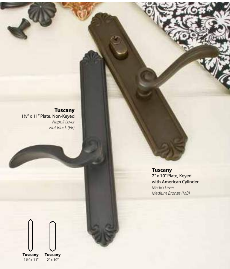
Tuscany 1½" x 11" Plate, Non-Keyed Napoli Lever Flat Black (FB)