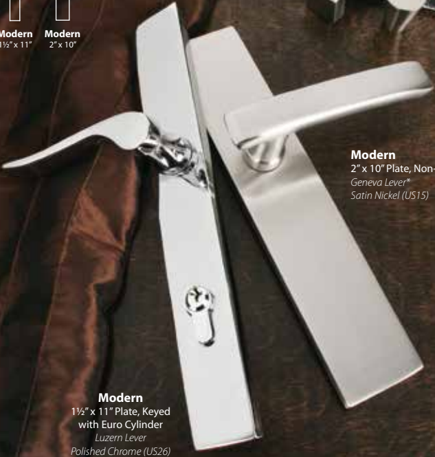
Modern 1 1/2" x 11" Plate, Keyed with Euro Cylinder Luzern Lever Polished Chrome (US26)