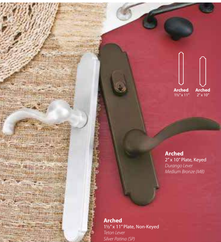
Arched 1 1/2" x 11" Plate, Non-Keyed Teton Lever Silver Patina (SP)