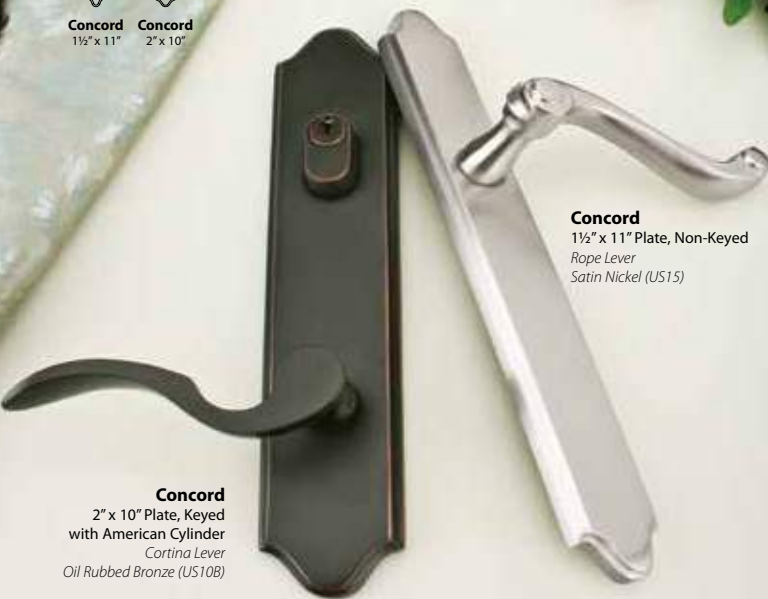
Concord 1 1/2" x 11" Plate, Non-Keyed Rope Lever Satin Nickel (US15)