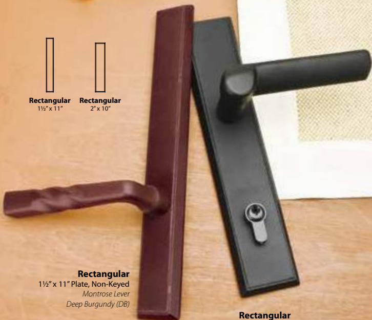
Rectangular 1 1/2" x 11" Plate, Non-Keyed Montrose Lever Deep Burgundy (DB)